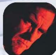
See who is at your front door at night