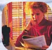
Screen visitors to your office before you let them in