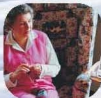
Protect vulnerable senior citizens from persuasive con-artists