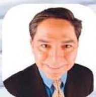
Get rid of nuisance doorknockers easily and safely!