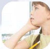
Safeguard children - teach them not to open the door to strangers!